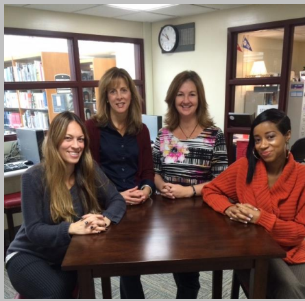
Windsor Locks High School Counseling Staff Members